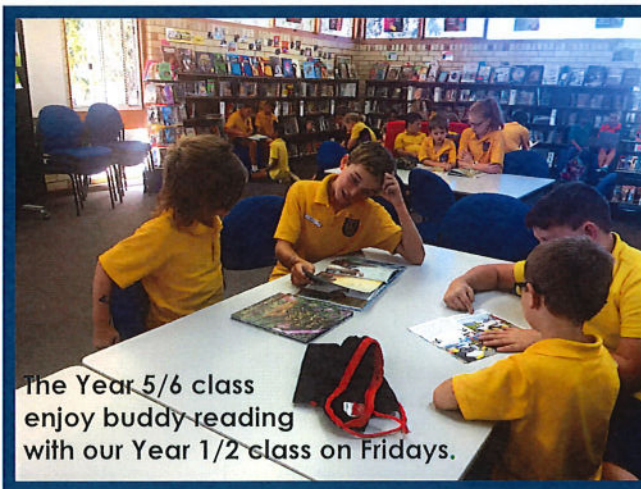
The Year 5/6 class enjoy buddy reading with our Year 1/2 class on Fridays.